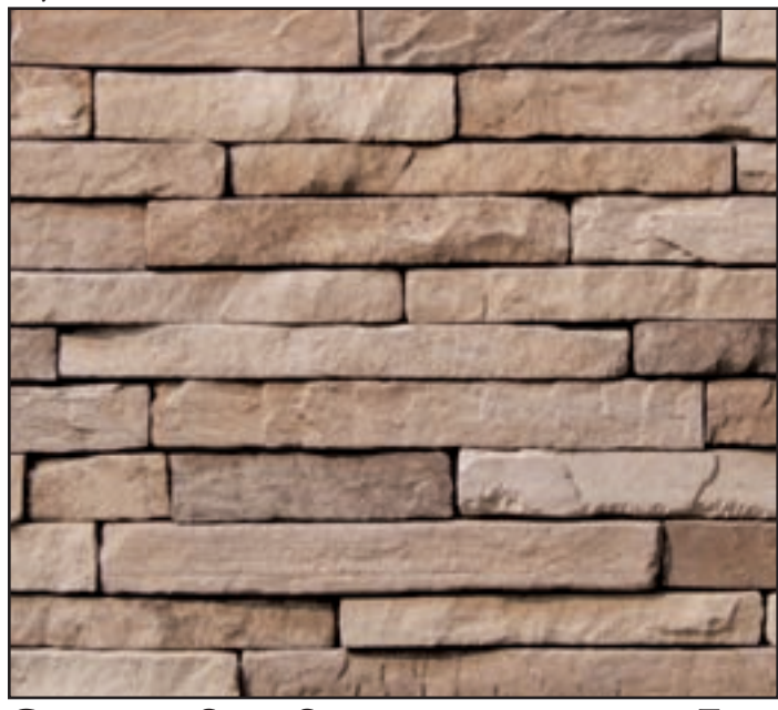
CORONADO STRIP STONE